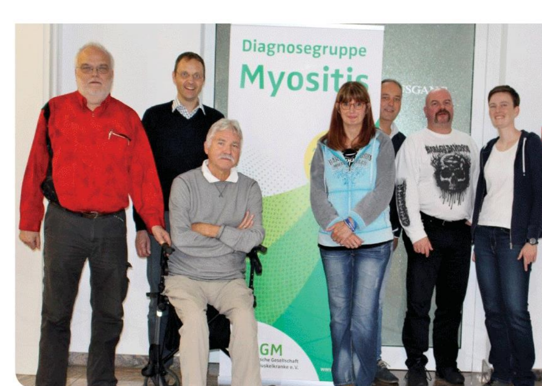
Working Group „Myositis-Gruppe“