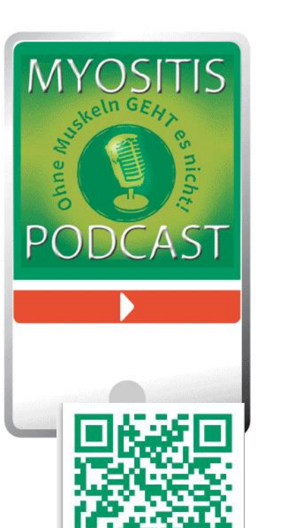
Listen to it (German language)